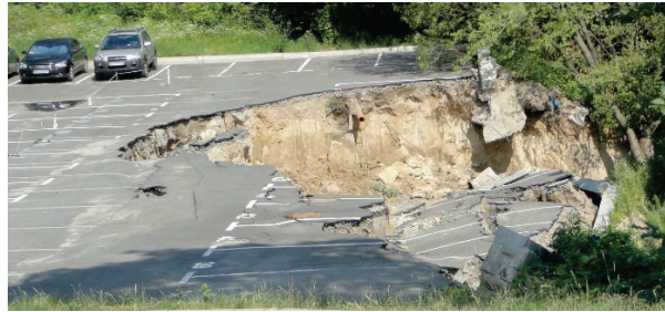
Figure 1 Landslide state in the slope upper part.

The study object is a portion of a mainly landslide and partially landslide-hazardous soil slope, the steepness of which is 20-22° on average. The slope height is 35-37 m. In 2008, high-rise buildings were erected at the slope upper part. During engineering and geological surveys on the slope portion and adjacent territory carried out in connection with the structures construction, the development of dangerous geological processes and phenomena is noted. On the slope a landslide occurred. The landslide had a width about 34 m and length of 13÷52 m (Fig. 1).